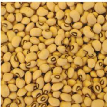
BROWN EYED PEAS