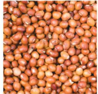
RED PIGEON PEAS