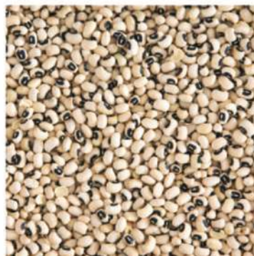
BLACK EYED BEANS