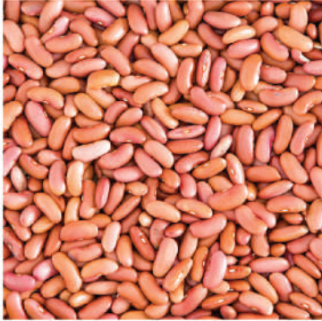
LIGHT SKIN KIDNEY BEANS