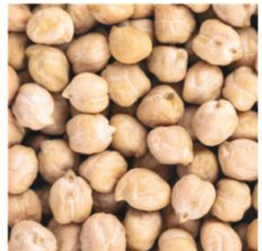
KABULI CHICKPEAS BIG