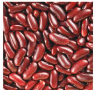
RED KIDNEY BEANS