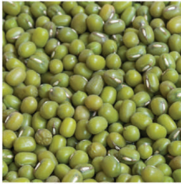
GREEN MUNG BEANS