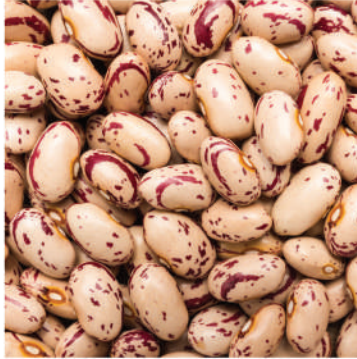
LIGHT SPECKLED KIDNEY BEANS