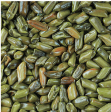
CASSIA TOREA SEEDS