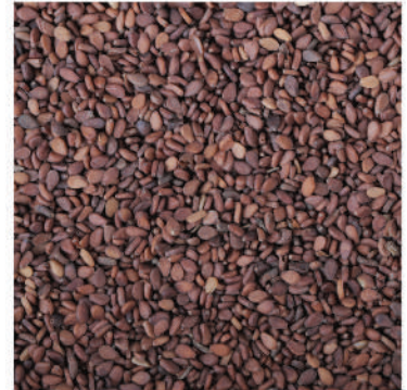
DOUBLE SKIN BROWN SESAME SEEDS