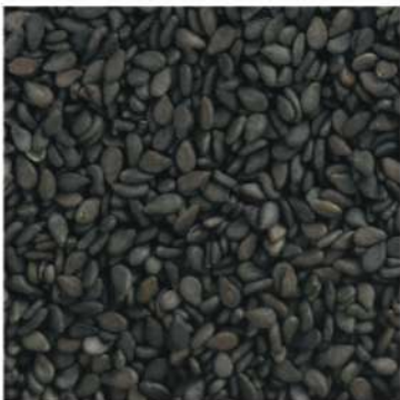
Z BLACK SESAME